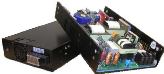
E Type (Enclosed with built-in Fan): 9(L) x 5(W) x 1.6(H) inches. U Type (U-Chassis Type): 8(L) x 5(W) x 1.6(H) inches.